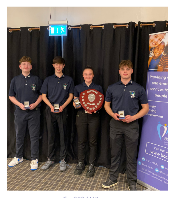
The 2024 Winners Ashton-under-Lyne Golf Club

With in excess of 100 clubs from all over the country taking part, the tournament is great fun and gives junior golfers of all abilities the opportunity to represent their clubs, play competitively against other golf clubs not necessarily in their usual catchment area or junior programme, make new friendships, and help a very worthy child-focused charity in BCCS.