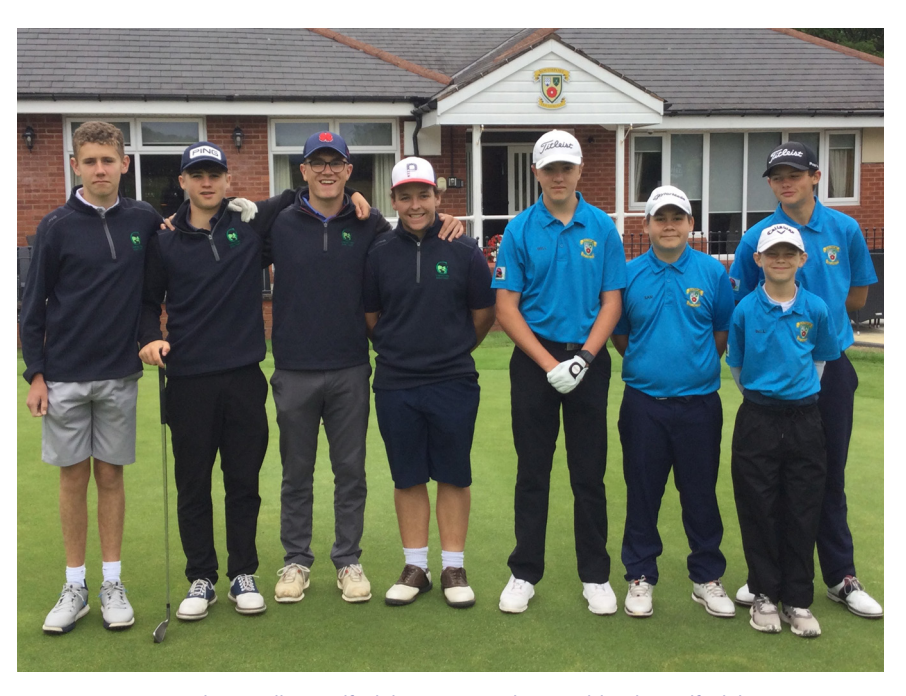
Greetham Valley Golf Club versus Southport Old Links Golf Club

Just to say thank you, once again for you organising of the National Junior Championship.