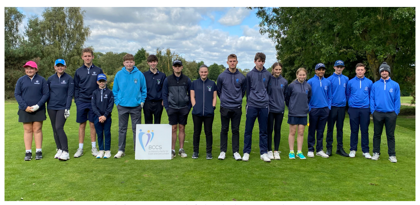
The four teams contesting the finals weekend at Staverton Park - 2024

Photos and a summary of the Finals Weekend from the 2024 competition can be found here: https://www.bccs.org.uk/get-involved/national-junior-golf-knockout-2024/national-junior-golf-knockout-2024-winners/