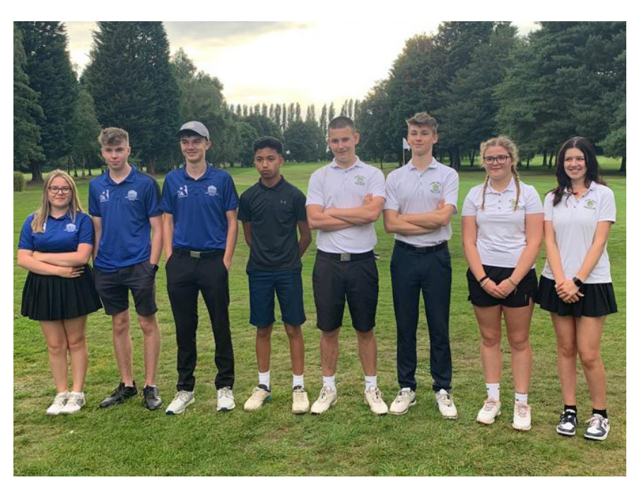
Belton Woods Golf Club versus Ashby Decoy Golf Club

Wow what a game we had last night with West Derby, talk about swings and roundabouts, it all came down to the last hole, we had to win it to force extra holes, which we managed to do, then we hole a monster putt for a win on the first extra hole, my nerves are shot.